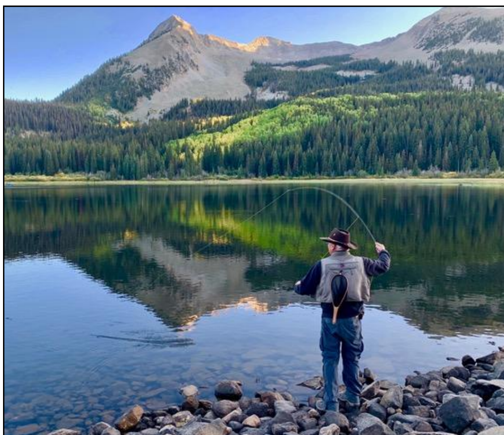
Nice Day Near Crested Butte, Colorado Second Place Winner of 2023 HFFA Show Photo Contest