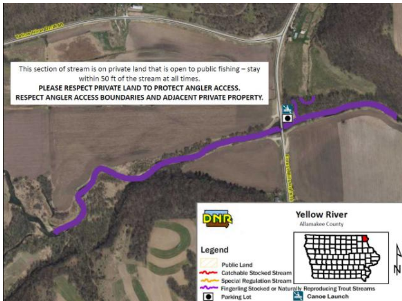
Photo 1: Iowa DNR trout map showing location of Water Quality and Angler Access easement on the Dianne Rissman farm.

Farming the fertile lands along the Yellow River is a way of life on the Rissman family farm. That way of life had become much more difficult as numerous floods over the past few years threatened fields, crops, and streambanks along the river. As a result, the Rissman family was looking for ways to improve their agricultural operation so it was more resilient to flooding. In August 2018, the Rissman family met with local DNR Trout Program staff to discuss the Water Quality and Angler Access program. By November 2018, the Rissman family had enrolled a section of their stream in the program. Their easement permanently protects 0.85 miles of Iowa trout stream with a 200 ft stream corridor easement allowing public fishing access. The easement also protects approximately 22.13 acres of stream corridor. Anglers can access the easement from a parking area on the east side of Forest Mills Road. In this area, the Yellow River has a strong population of wild, naturally reproducing Brown Trout and is stocked annually with fingerling Rainbow Trout. The trout population is managed under statewide regulations.