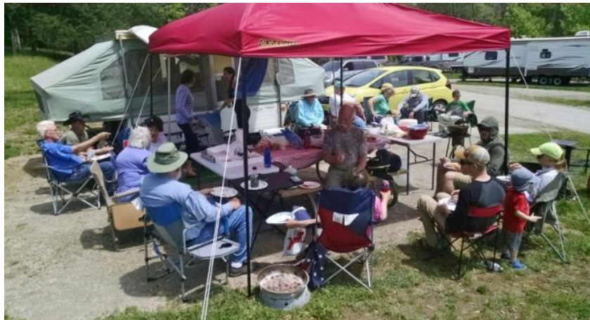
shows the group.