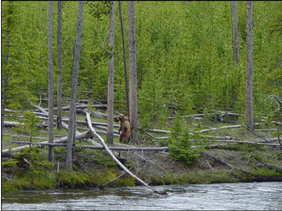
"Got An Itch to Fish the Madison"