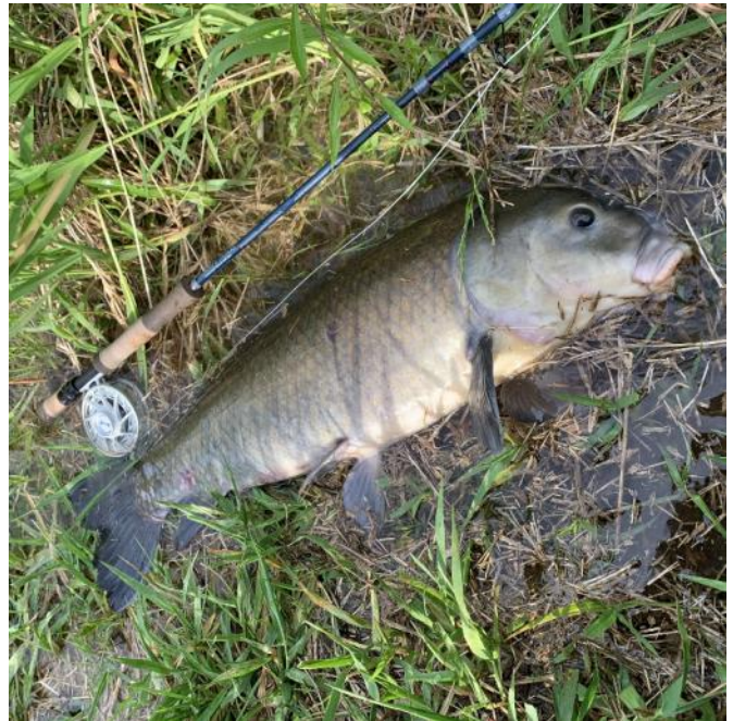
Photos above are from Davis with a Golden Redhorse Sucker on left and Black Buffalo on right